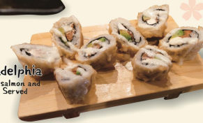
112. Golden Philadelphia Deep fried roll with salmon and cream cheese inside. Served with cheese mayo.