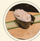
18. Chop Chop (Limit 2 per person)