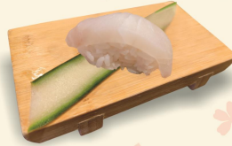
12. Red Snapper