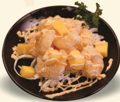
121. Mango Shrimp