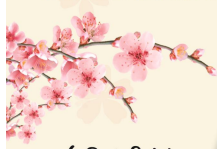
6. Crab Stick