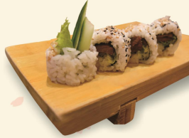
53. Alberta Roll Grilled teriyaki beef, cucumber inside, with sesame seed on top.