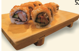
52. Canadian Roll Crab stick, sushi shrimp, cucumber and plain mayonnaise inside, with masago on top.