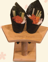
59. Spicy Tuna