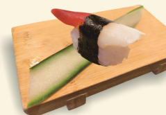
15. Surf Clam