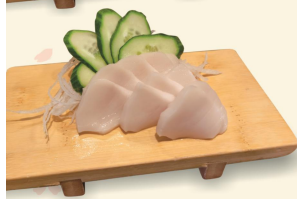
9. Butter Fish (White Tuna)