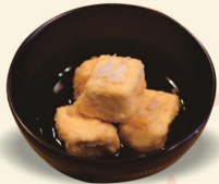
102. Agedashi Tofu