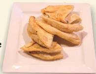
103. Green Onion Cake