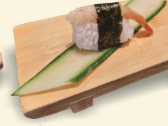
26. Sweet Shrimp