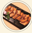
90. Grilled Pork Belly