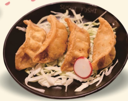
123. Deep Fried Gyoza