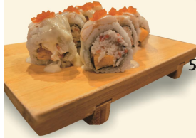
54. Alaska Roll Crab meat, tamago inside, with sushi shrimp on top, dress with house special mayo.