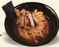
92. Udon Soup (Choose From Chicken, Veggie, Beef, Seafood, Pork Belly)