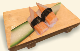
14. Crab Stick