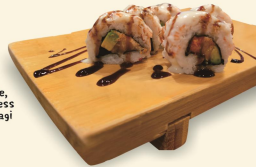
55. Sunset Roll salmon, avocado, masago and plain mayonnaise inside, with crab stick on top, dress with cheese sauce and unagi sauce.