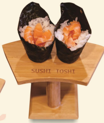
58. Spicy Salmon