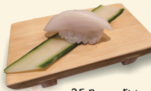
25. Butter Fish (White Tuna)