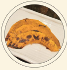
88. Grilled Pumpkin