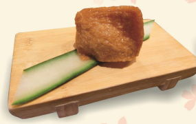
23. Inari (seasoned bean curd)