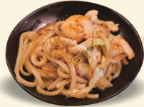
91. Stir Fried Udon (Choose From Chicken, Veggie, Beef, Seafood)