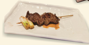
98. Teriyaki Beef