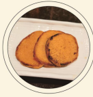
89. Grilled Sweet Potato