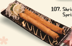
107. Shrimp & Cheese Spring Roll