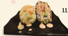
111. Golden Big Eye Deep fried futomaki with sriracha salmon and cucumber inside. Served with spicy mayo.