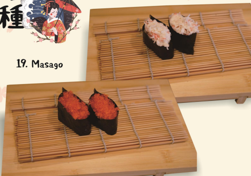
20. Shredded Crab