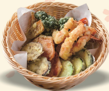
122. Tempura Squid