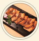
90. Grilled Pork Belly