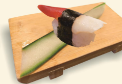
15. Surf Clam