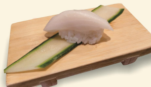
25. Butter Fish (White Tuna)