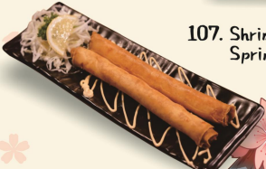
107. Shrimp & Cheese Spring Roll